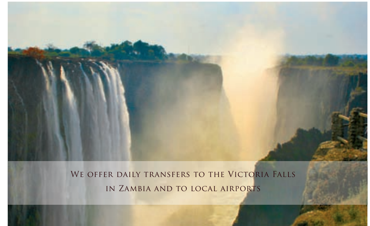
WE OFFER DAILY TRANSFERS TO THE VICTORIA FALLS IN ZAMBIA AND TO LOCAL AIRPORTS