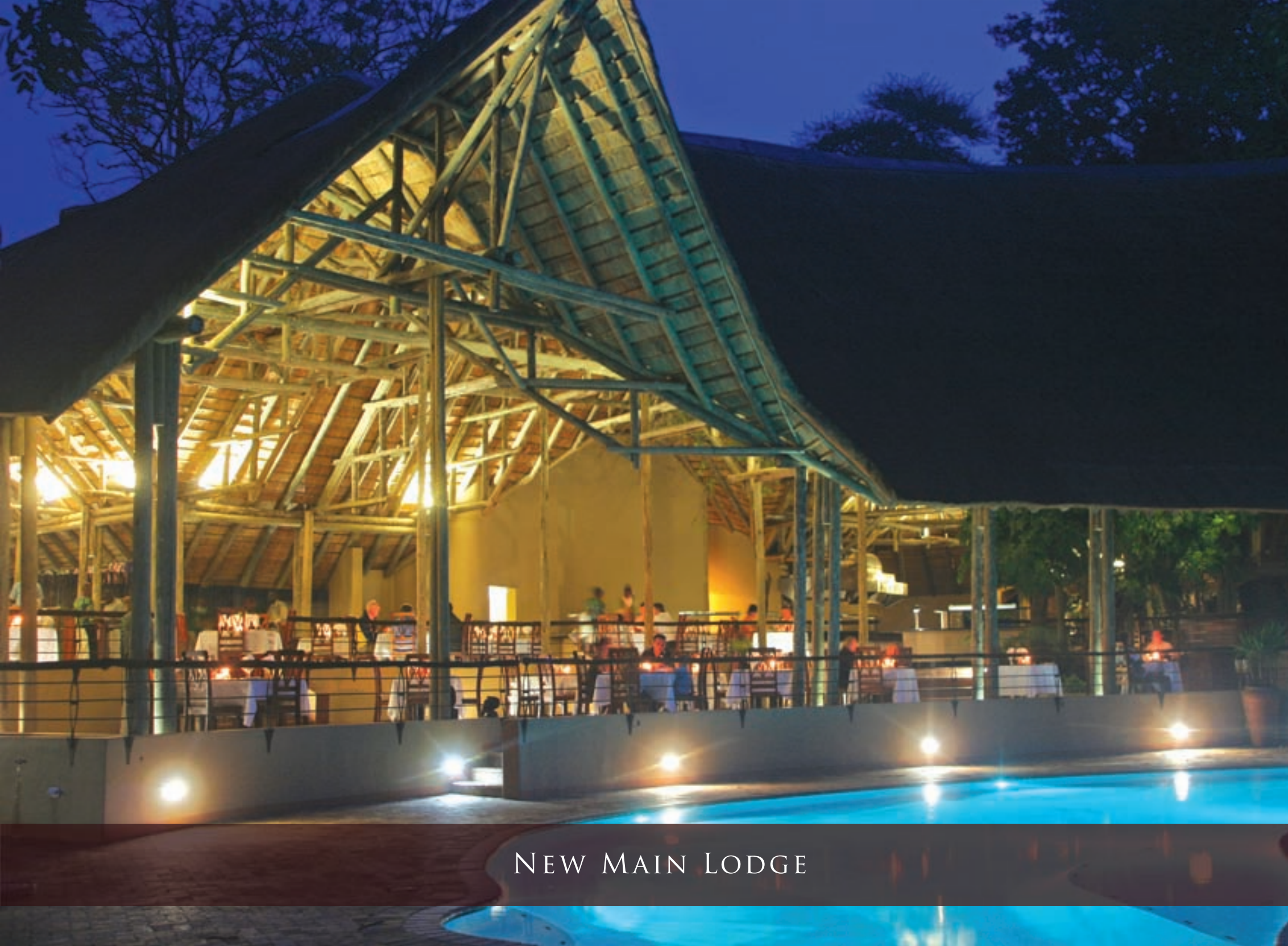
NEW MAIN LODGE

CHOBE IS ONE OF THE MOST PROLIFIC WILDLIFE AREAS IN AFRICA AND OFFERS EXTENSIVE GAME VIEWING FROM WATER AND LAND