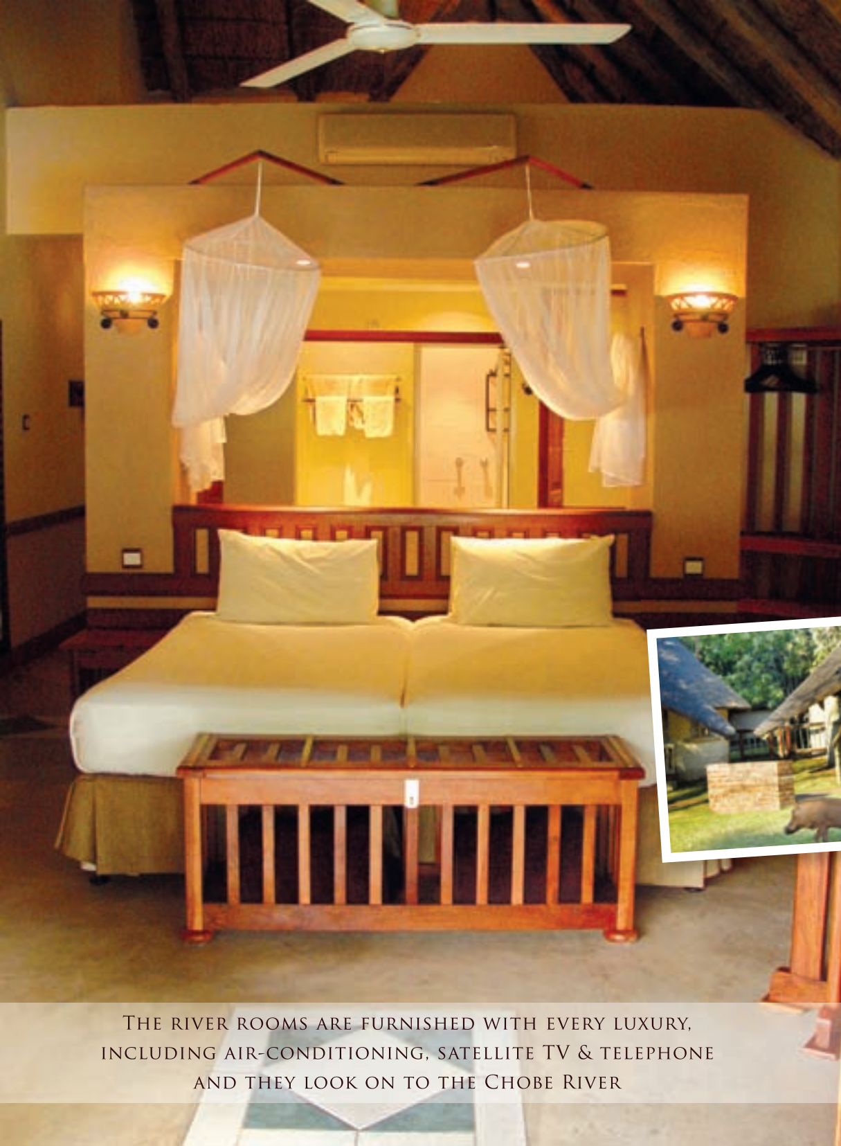
THE RIVER ROOMS ARE FURNISHED WITH EVERY LUXURY, INCLUDING AIR-CONDITIONING, SATELLITE TV & TELEPHONE AND THEY LOOK ON TO THE CHOBE RIVER