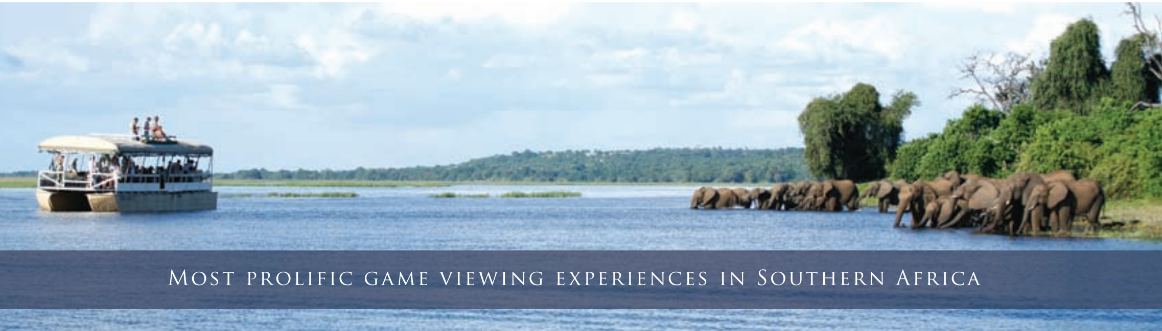
MOST PROLIFIC GAME VIEWING EXPERIENCES IN SOUTHERN AFRICA