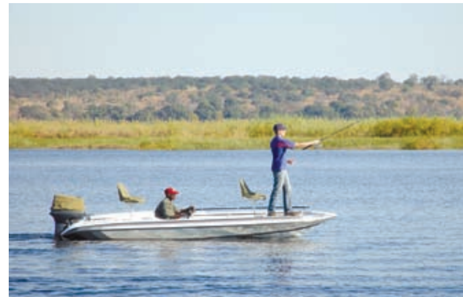
OUR LODGE IS YOUR GATEWAY TO THE CHOBE NATIONAL PARK. A VARIETY OF ACTIVITIES, INCLUDING GAME DRIVES, BOAT CRUISES, WALKING SAFARIS AND FISHING ARE AVAILABLE THROUGH OUR BOOKING OFFICE.