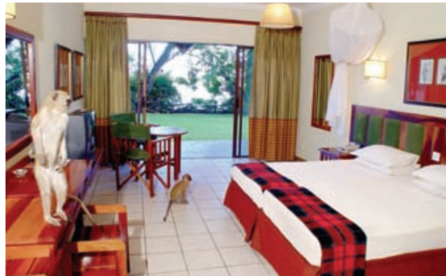
THE THATCHED RONDAVELS ARE INDEPENDENTLY POSITIONED, WITH CEILING FANS & EN-SUITE BATHROOMS