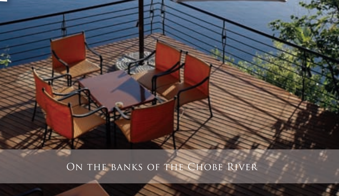
ON THE BANKS OF THE CHOBE RIVER

WE HAVE A SQUASH COURT, BEAUTY SALON, INTERNET CAFE, RIVER BAR, RESTAURANT AND CURIO SHOP THAT COMPLETE OUR HOST OF FACILITIES.